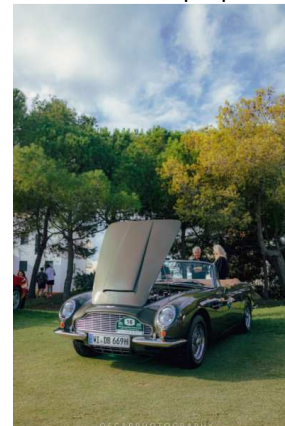
It is important to maintain the value of the car by taking good care of it and avoiding corrosion damage. Here is a picture from Aston Martin Mallorca Car Week

The London-based Historic Automobile Group International (HAGI) has been looking into the subject in more detail since 2008. Among other things, HAGI published a book entitled ‘Better Than Gold, Investing in Historic Cars’ . In principle, HAGI advises against viewing vehicles purely as an investment and acquiring them for this reason alone, especially in comparison with traditional asset classes such as financial investments in shares or bonds, which are far more suitable for this purpose.