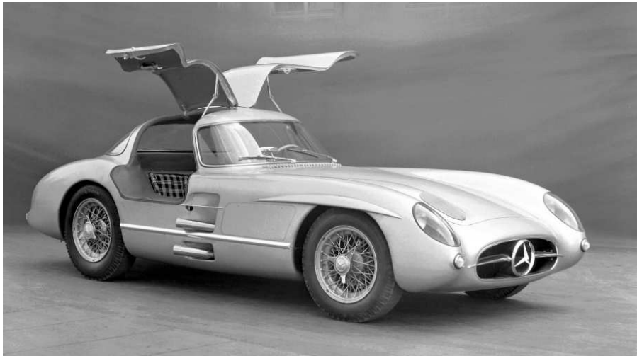
Mercedes Benz W196S was sold in 2022 for an unrivalled 142 million dollars.